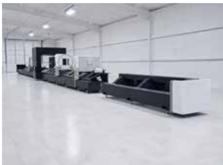
01 | Tube Laser

Our success is built on the foundation of cutting-edge technology and machinery. Detailed below are our core equipment and capabilities: