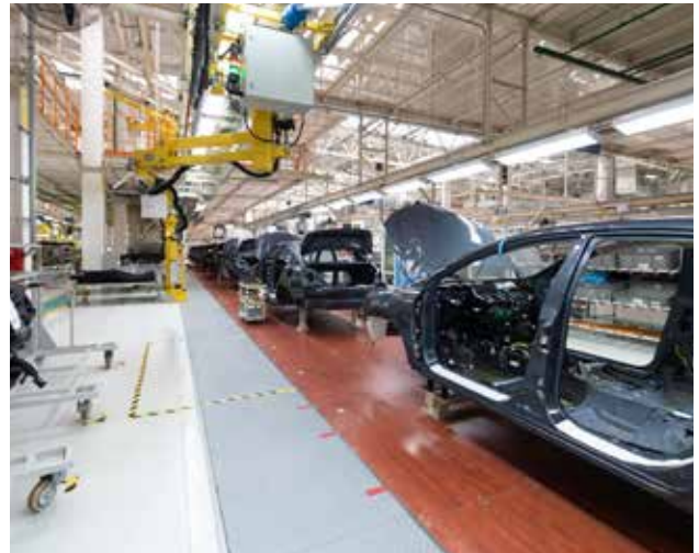
Automotive: Frames, panels, and precision parts.