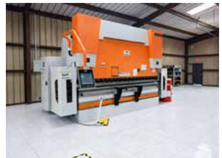
03 | Press Brake