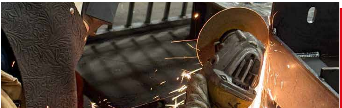
Custom Fabrication: Flexible production lines for tailored solutions.