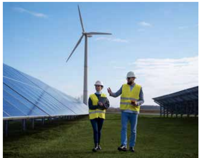
Renewable Energy: Wind turbine parts and solar panel frames.