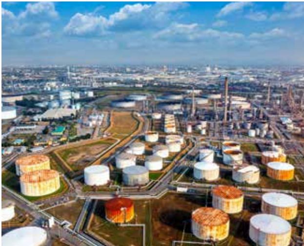
Oil and Gas: Pipeline supports and industrial equipment.