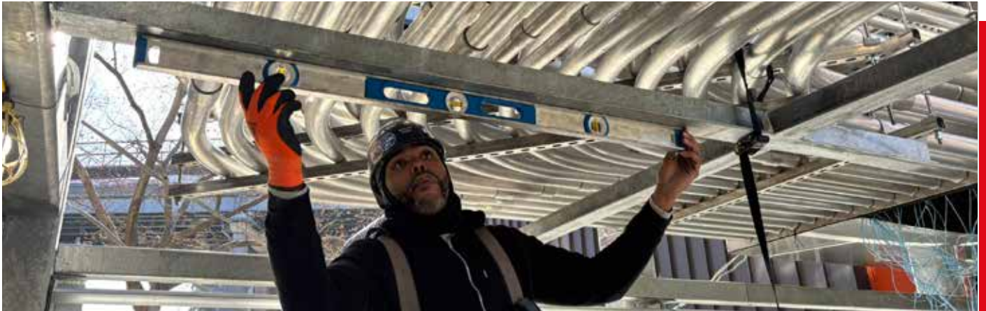
Skilled Workforce: Certified technicians and engineers with extensive experience.