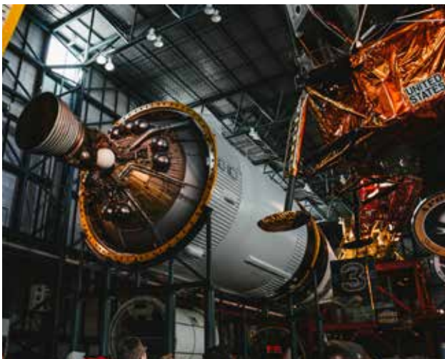
Aerospace: Lightweight and high-strength components.