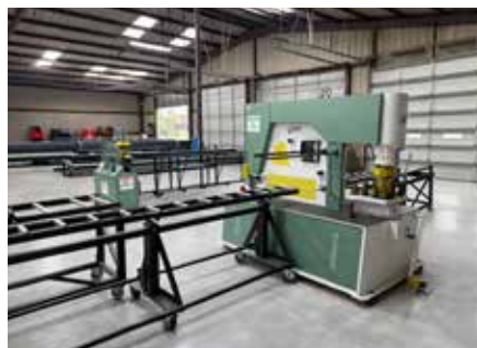
08 | Iron Worker