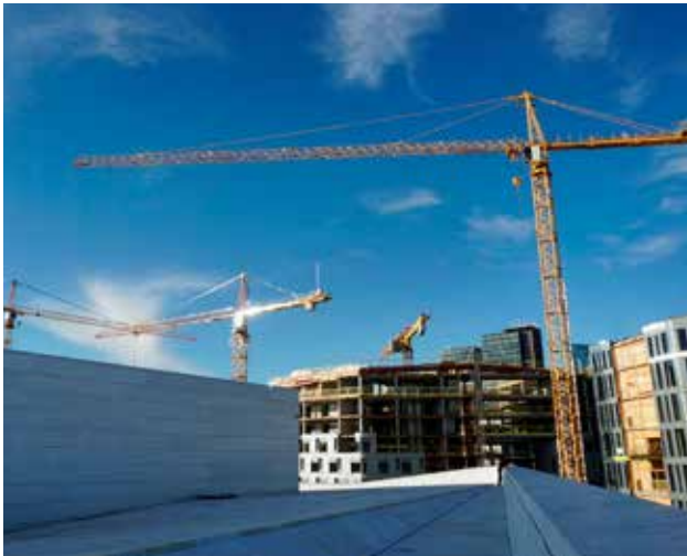
Construction: Structural components and architectural features.

We cater to diverse industries, including: