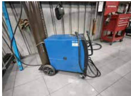
05 | MIG Welding