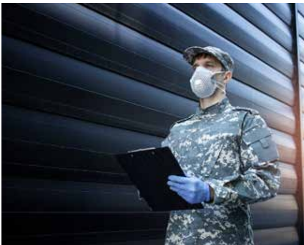
Defense: Custom metalwork for secure applications.