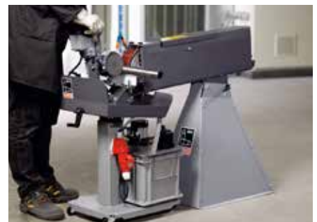
09 | Tube Sanding