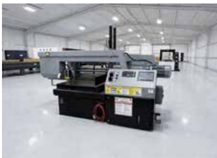
07 | Gang Band Saw