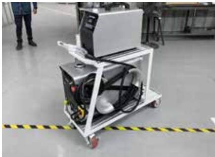
04 | Laser Welder