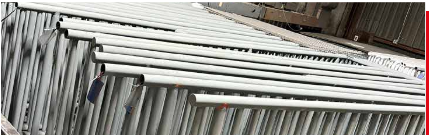
Capacity: Capable of handling high-volume orders without compromising quality.