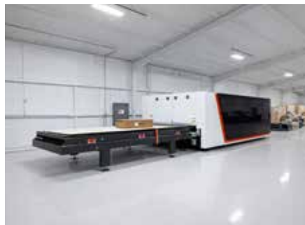
02 | Flat Laser