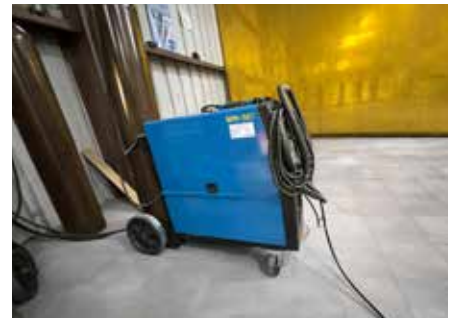
06 | TIG Welding