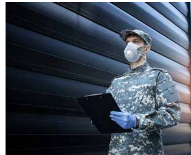
Defense: Custom metalwork for secure applications.