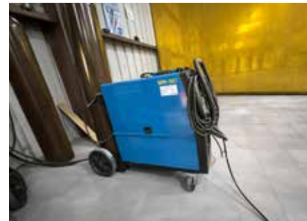
06 | TIG Welding