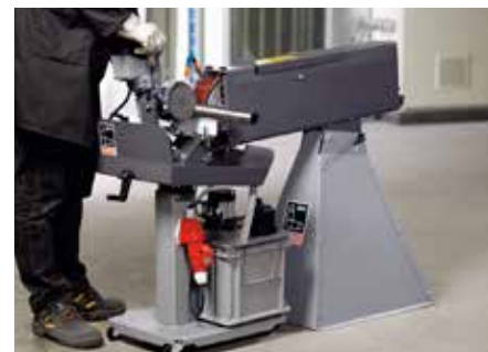
09 | Tube Sanding