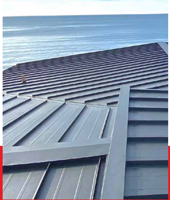
Mechanical Lock Panels