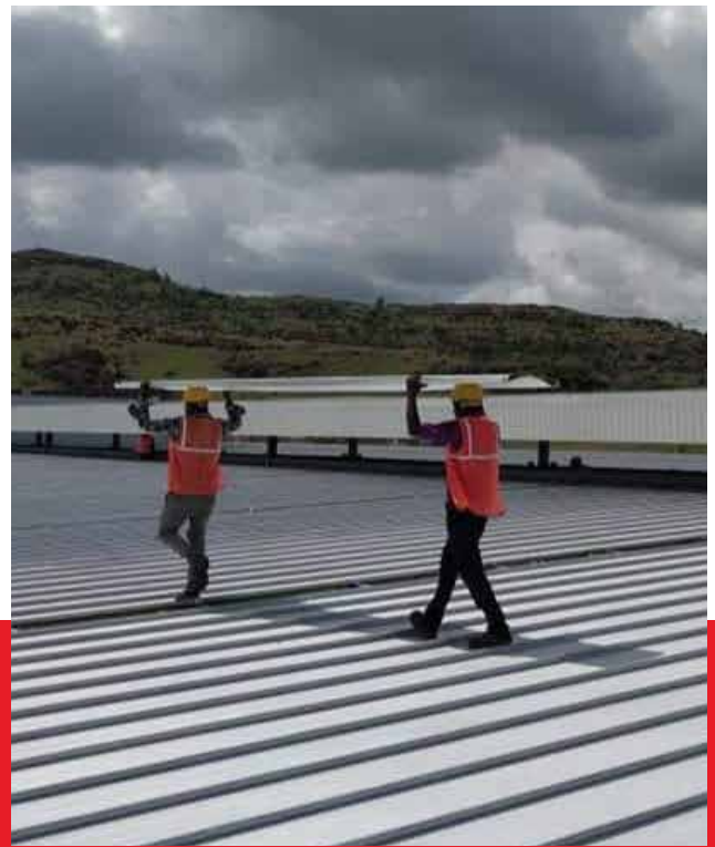
Structural Standing Seam Panels