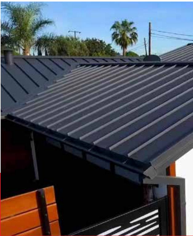
Nail/ Fastener-Lock Panels